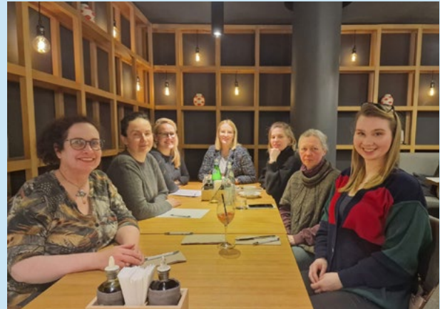
Group photo of the motivated and upbeat ladies at the inaugural meeting of the new Inner Wheel Club of Riga-Jurmala on 2 March 2022.

Inner Wheel worldwide welcomes 12 new charter members of the new non-districted club of Inner Wheel Club of Riga-Jurmala in Latvia.