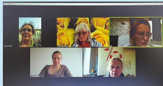
Gallery photo on Zoom shows the interested ladies in intense discussions and last instructions before the inaugural meeting.