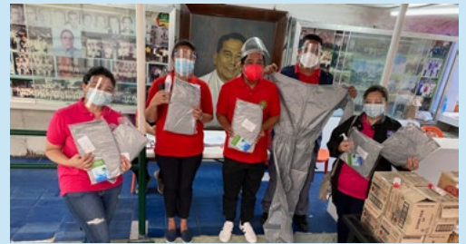
"Blessing the Frontliners": donation of hygiene kits and PPE suits to Medical Frontliners of PJG Hospital on Sept. 29, 2021

She participated in two (2) ten-day Mission Trips to Mumbai, India in December 2014 and December 2015.